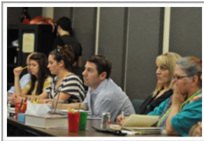
Creative Team of The Merry Wives of Windsor

The Shop and Stage Crew builds the set, props and costumes according to the designer's plans. The Stage Crew sets the stage with props and furniture, assists the actors with costume changes and operates sound, lighting and stage machinery during each performance.