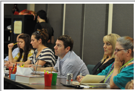
Creative Team of The Merry Wives of Windsor

The Shop and Stage Crew build the set, props and costumes according to the designer's plans. The Stage Crew sets the stage with props and furniture, assists the actors with costume changes and operates sound, lighting and stage machinery during each performance.